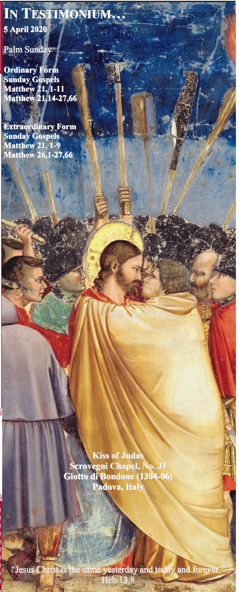
Kiss of Judas Scrovegni Chapel, No. 31 Giotto di Bondone (1304-06) Padova, Italy

"Jesus Christ is the same yesterday and today and forever." Heb 13,8